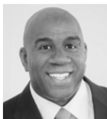
Earvin "Magic" Johnson