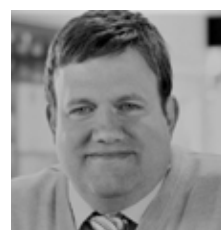
Dr. Frank I. Luntz