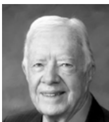
President Jimmy Carter

We bring a variety of speakers each year to the Annual Family Office Investment Symposium, ranging from political commentators to professional athletes. Lido Consulting understands the value of inspiration when it comes to providing a unique, impacting, and insightful agenda at our conference.